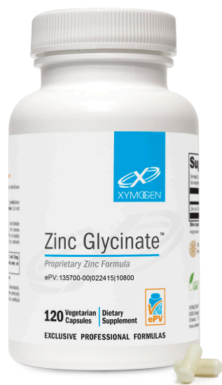
Available in 120 capsules