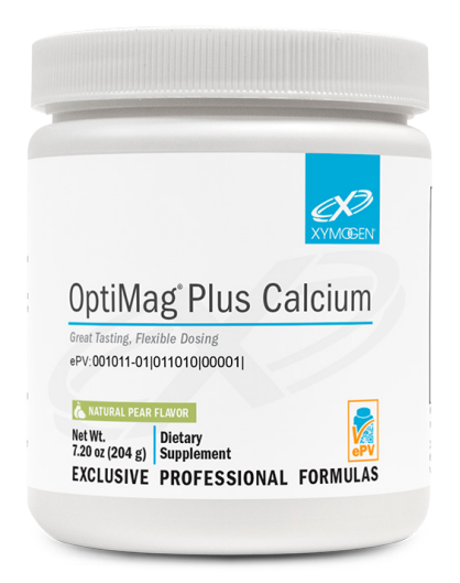
Available in Natural Pear