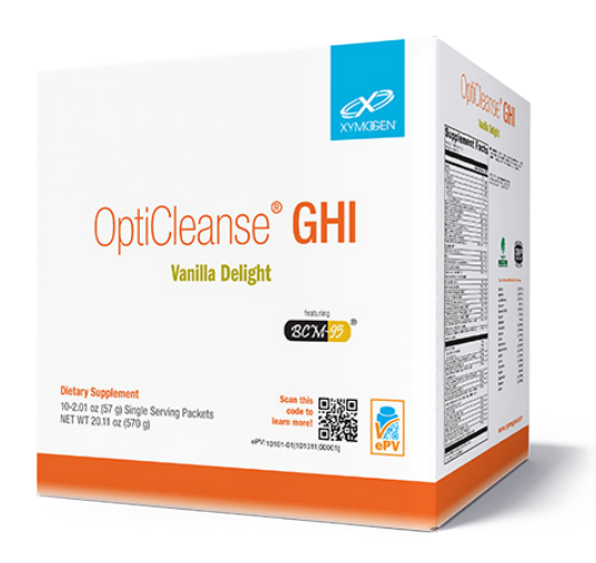
Available in Vanilla Delight, Creamy Chocolate, and Chai