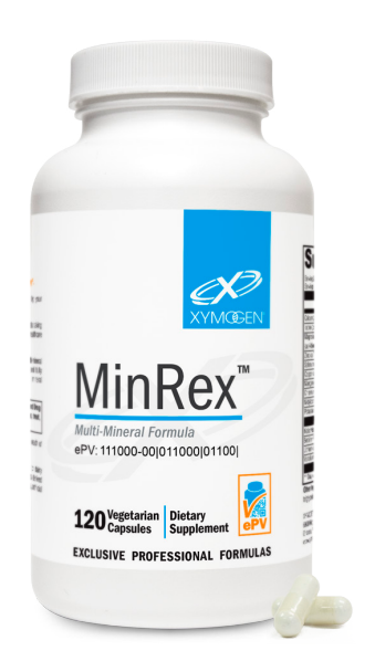
Available in 120 capsules