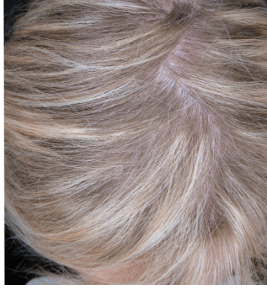
BEFORE Day 0