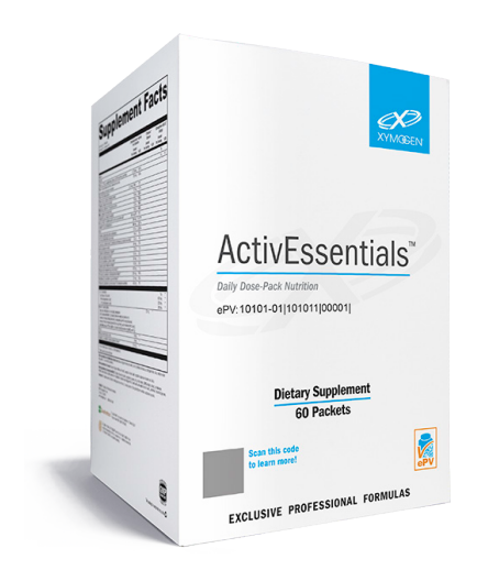
ActivEssentials is available in 60 packets ActivEssentials for Women is available in 60 packets ActivEssentials with Calcium is available in 60 packets